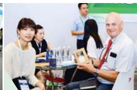
Chain Supermarket Session