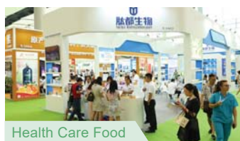
Health Care Food