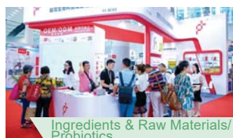
Ingredients & Raw Materials/ Probiotics