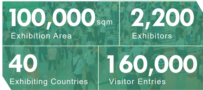
(The above are projected figures.)

The 28 th China (Guangzhou) International Health Industry Expo (IHE China-Inter Health Expo) is an Informa trade event. Inter Health Expo is an international annual B2B trade show on nutrition, health food and health care products held at the Guangzhou Import and Export Fair Complex. Being the first of its kind in introducing 'big health' concept onto a trade show platform in China, Inter Health Expo is a significant health industry exhibition in China.