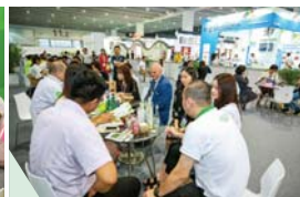
Shantou City Purchaser Session