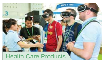
Health Care Products