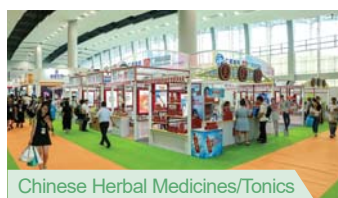
Chinese Herbal Medicines/Tonics