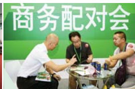
Importer/ E-commerce Session